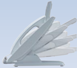
Bluetooth® Module (KX-NT307)